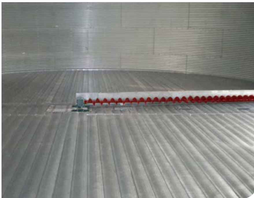
Full perforated plank floors allow for drying or conditioning and to distribute air evenly up through the stored product.