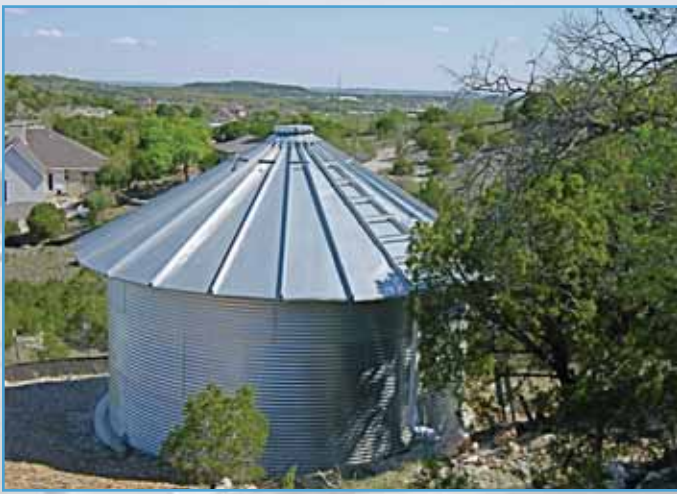
Water Storage Tank for agricultural use