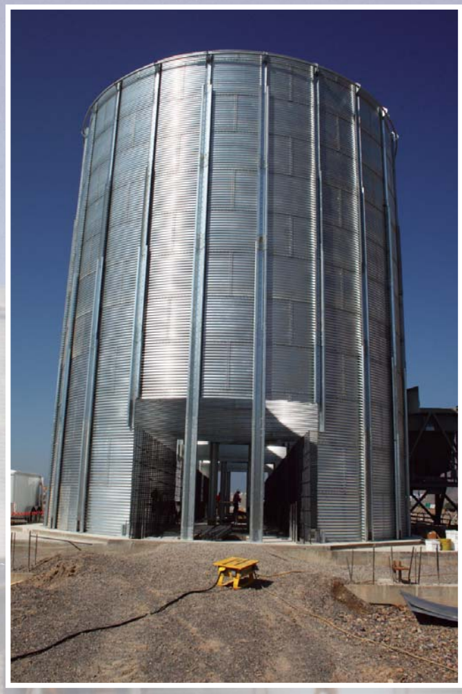
Aggregate Silos are manufactured from heavy gauge stiffeners and 8 gauge wall sheets.