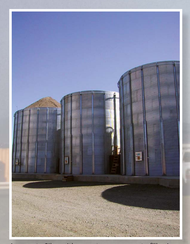
Aggregate Silos with open tops are easy to fill using a portable inclined conveyor.