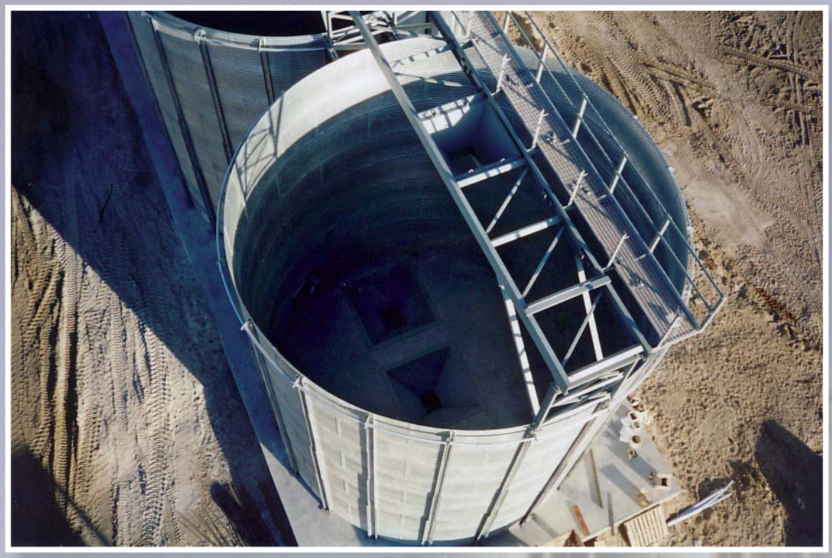
Aggregate silo showing discharge openings at floor level.